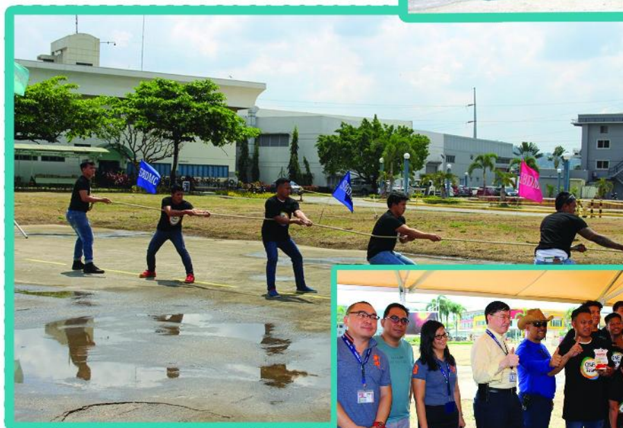
Tug of War Winner: Tong Lung (Phils.) Metal Industry Co., Inc.