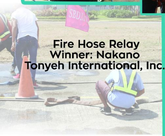
Fire Hose Relay Winner: Nakano Tonyeh International, Inc.