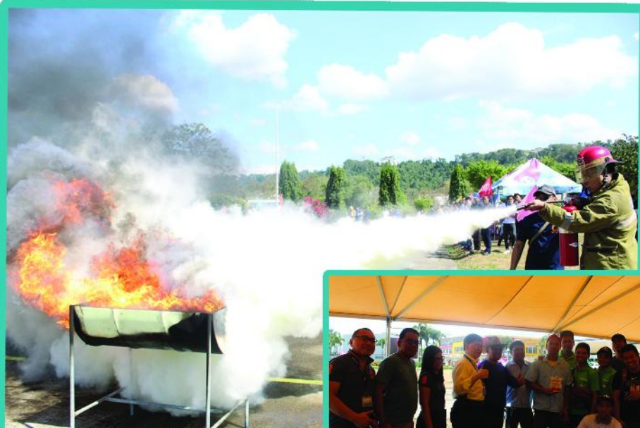
Fire Extinguisher Relay Winner :Johnson Controls Hitachi Air Conditioning Philippines, Inc.